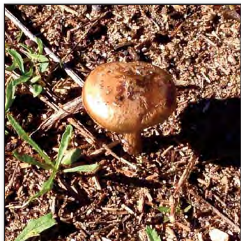
Moisture loving mushrooms were popping up everywhere!

The part of the wetlands known as Area B south displayed accumulated water and rivulets during January, February and most of March. This section lies south of Culver and directly below the bluffs, and still has a major stand of Willow trees, even during dry years.