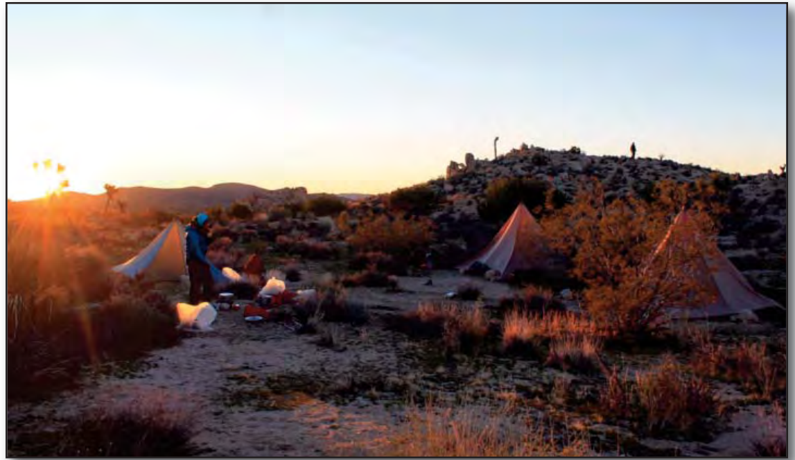
Outward Bound instructor passing by campsite during sunset.