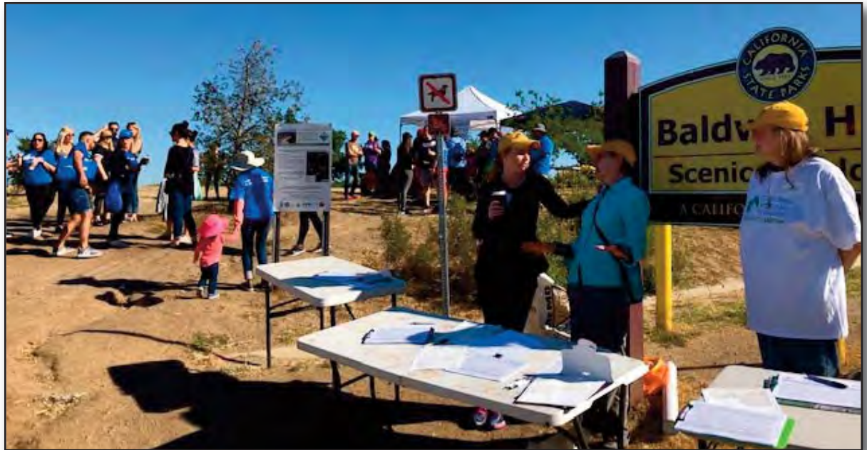
LA Audubon Staff & Volunteers information tables at the Earth Day 2019 habitat restoration event at BHSO

We thank the California State Parks Foundation and the local community for their ongoing support of nature in LA!