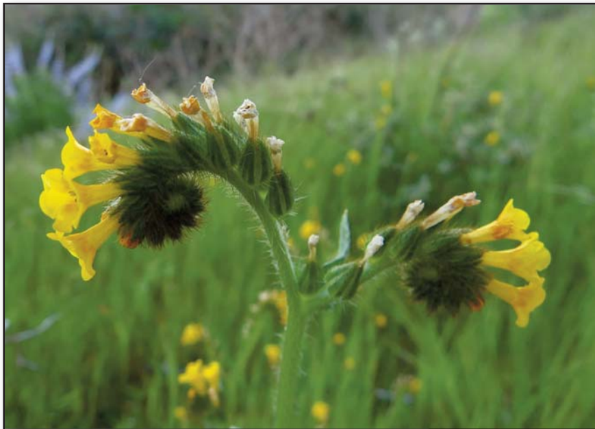
No need to drive great distances to see a “Super Bloom”. It is here in our own backyard, and can be viewed at our next Open Wetlands on May 4th.

It seems that the rains have now abated for the season, and extravagant displays of wildflowers are now present throughout the wetlands. Lupine, sunflowers, deerweed and many other natives are showing off their spring finery.