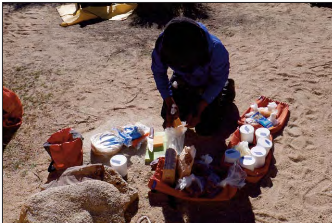
Felistus, assembling lunch for the rest of the backpacking group.

Edgar — Our last full day at Joshua Tree was also our busiest. The instructors had a full schedule of climbing and repelling planned. The excitement in the group for this second