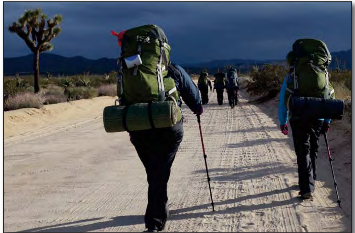
Outward Bound California instructors and Los Angeles Audubon backpacking group, hiking to the first camping site.