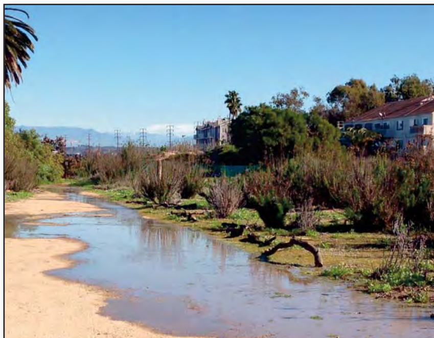
This is the trail that school children use to access the wetlands for their field trips. More than a few trips had to be re-scheduled due to rainy conditions.