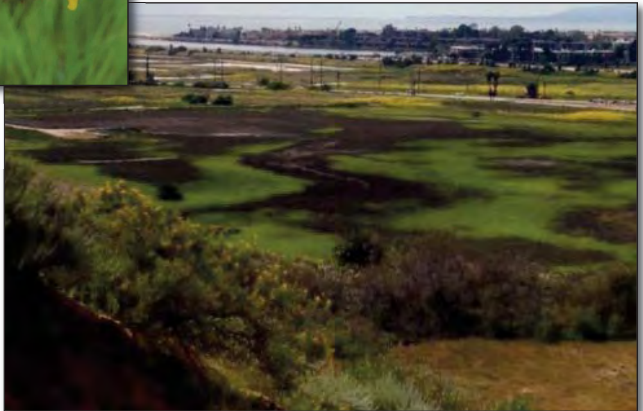
Although the water has diminished, the plants that are now present echo the shape of the standing water that was present for most of the season. Note the curvilinear course of the vegetation, which traces the meandering path that water takes naturally.

California Department of Fish and Wildlife, Army Corp of Engineers, and other stakeholders: Are you listening to the land? And to the frogs? 🐸