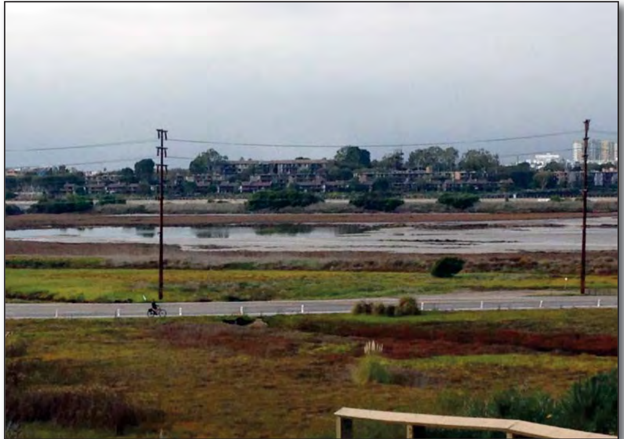
The historic salt panne at Ballona. Standing water covered the entirety of the salt panne for most of the winter.

This provided fodder for hundreds of Black Bellied Plovers, which were present throughout the winter. Ponds came to life below the Playa del Rey bluffs, and Pacific Chorus Frogs are still filling the nights with their ridiculously loud song. Normally dry trails flooded, and lichen and mushrooms turned up everywhere.